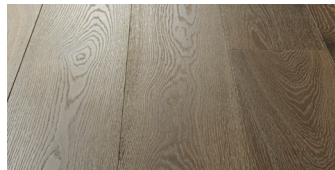
Ojai Oak AV750OJA