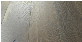
Big Sur Oak AV750Big