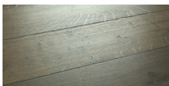
Del Mar Oak AV75ODEL