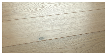
Laguna Oak AV75OLAG