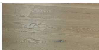
Balboa Oak AV75OBAL