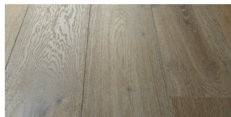
Pismo Oak AV75OPIS