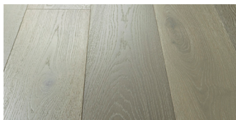
La Jolla Oak AV75OLAJ