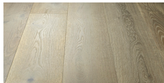
Cambria Oak AV75OCAM