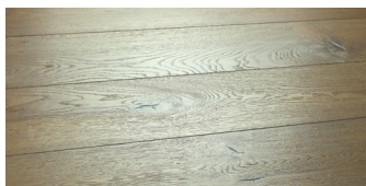
Malibu Oak AV75OMAL